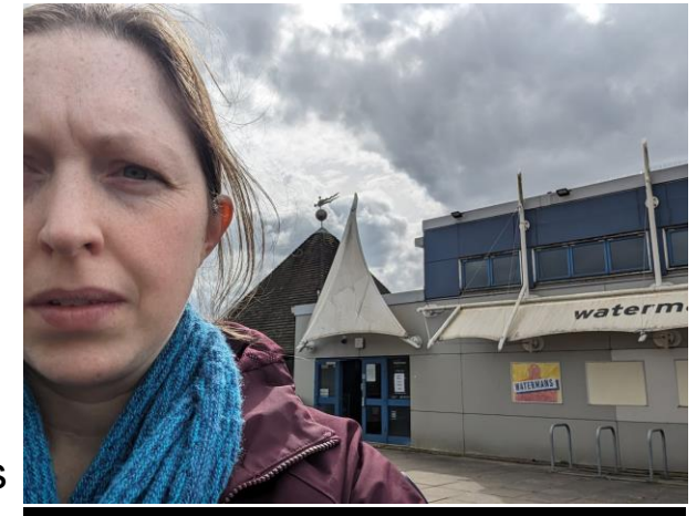
Watermans Art Centre closes early April

What about Retrofit First? Demolish and rebuild is not an appropriate solution during this Climate Emergency . Let's renovate our existing buildings.